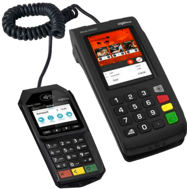
The Desk/1500 is supported by our Cloud Services